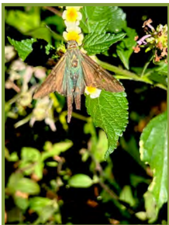
By Fall many butterflies, such as this Long Tailed Skipper, are showing wear and tear as they near the end of their life span. This one has been coming to the garden for several days and can usually be found on this lantana, a butterfly favorite.