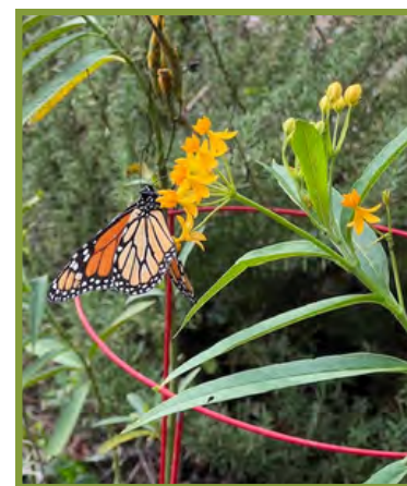
Although most Monarchs have migrated from our area and headed for Mexico, there are still some in the garden feasting on milkweed flower nectar. We grow numerous milkweed plants because its leaves are the only food their caterpillars can eat.