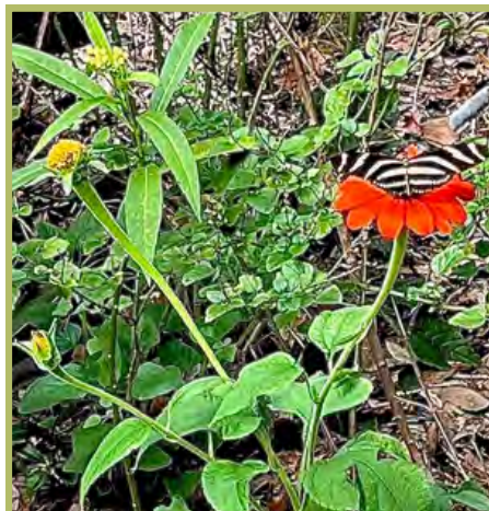
A record four Zebra Longwings are daily visitors to the garden this year. They normally live farther south, but climate change is encouraging them to travel to new areas such as South Carolina and even greater distances north of here. Zebra Longwings can often be seen on the lantana, but they can also like the Mexican sunflowers.