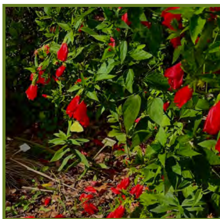
One of the loveliest plants at the garden is the Turk's Cap shrub that only flowers in the Fall in our area. Cloudless Sulphur butterflies with their buttery yellow color contrast beautifully with the brilliant red flowers.

April Gordon at dr.aprilgordon@gmail.com