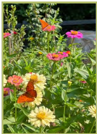
A fresh crop of zinnias has grown up from dropped summer seeds. Full of nectar, they are a favorite with butterflies such as these Gulf Fritillaries

Although the Fall days are getting shorter and somewhat cooler, in late November this year the garden remains filled with flowers and butterflies. And the forecast into early December promises more of the same with mostly mild days and nights. How long this pattern will continue is unclear, but I encourage you to enjoy the spectacle while it lasts. While some parts of the country have already experienced cold temperatures, snow, and even blizzards, I will be grateful if t-shirt weather and colorful butterflies fill my days instead for as long as possible.