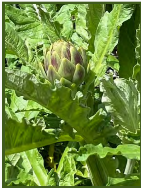
The current planting excitement in the community garden is over artichokes, which are now producing edible bulbs in more mature plants.