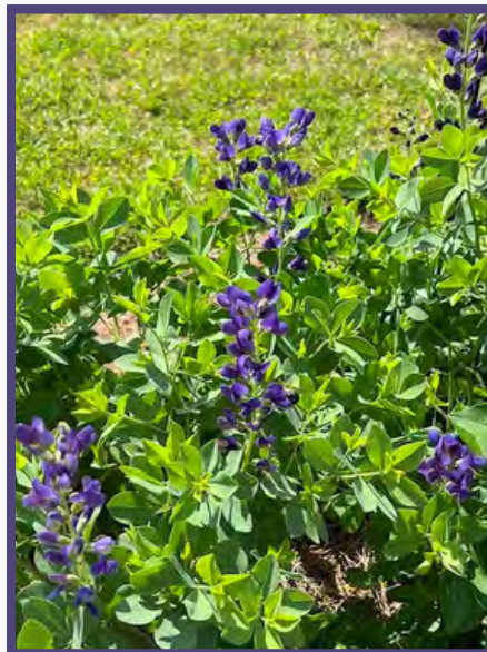
Blue false indigo gets its name from its use in colonial America to make a substitute dye for real indigo. Although unsuccessful as a dye, it is a beautiful plant that attract pollinators as both a source of nectar and as a host plant for several butterfly caterpillars