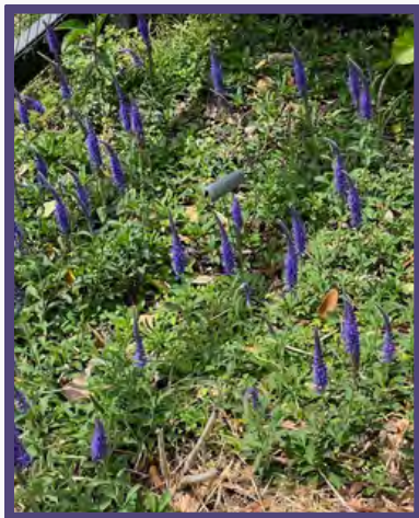
Stunning purple spires of native Veronica (speedwell) begin blooming in the spring in time to provide nectar for hungry pollinators

If you are interested in volunteering at the garden (see the April Newsletter for details), contact April Gordon at dr.aprilgordon@gmail.com .