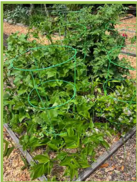
This garden is packed with such goodies as beans, tomatoes, peppers, and even ripening blueberries