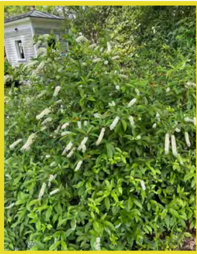
Henry's garnet sweetspire has it all: a native plant, it remains green year-round, has fragrant clusters of drooping white blossoms that appeal to butterflies, moths, and bees in the spring, and garnet red leaves in the fall.

Plentiful rainfall and mild temperatures in April have resulted in robust growth in many of our perennial flowering plants. Several of them are now blooming. In tandem with the increase in flowering plants, the number and diversity of butterflies and bees will also be steadily expanding until the peak of the season in September and October. It is worth a visit to the garden in May to enjoy the current color show.