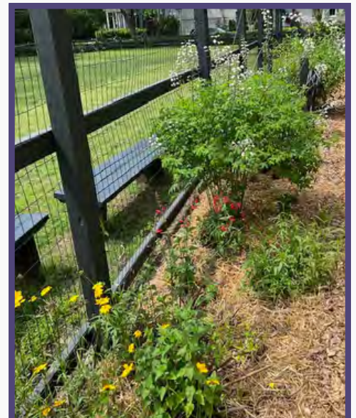
The white variant of false indigo is an eye-catching early bloomer that forms a lovely tapestry of white, red, and yellow flowers with scarlet salvia and sunny coreopsis