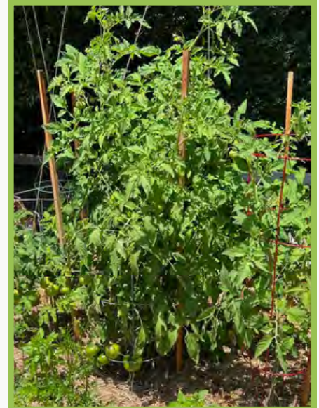
Multiple large tomatoes were ripening in mid-May in this garden in 2023 which we hope to emulate in 2024