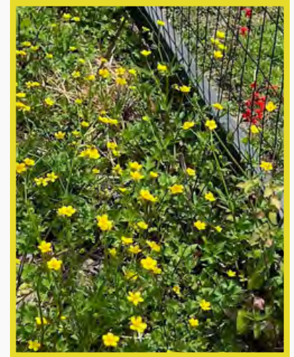
Low-growing creeping buttercup is a native wildflower that produces profuse numbers of vivid yellow flowers that attract pollinators in the spring. It complements the brilliant red of the scarlet salvia that will continue to bloom all summer

Start by strolling through the garden to see individual plants up close along with the bees and butterflies feasting on their pollen and nectar. Then outside the garden fence rest for awhile on our teak benches in the cool shade of huge oak trees where you can take in the totality of the butterfly garden along with the lush community garden with which it is associated. Come back often to see the many changes that occur in the months ahead.