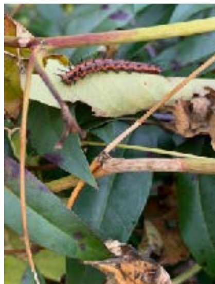
A few Gulf Fritillary caterpillars remain on garden passionvines

April Gordon at dr.aprilgordon@gmail.com