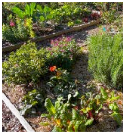
A sample winter gardens includes a mixture of vegetables (e.g. Swiss chard and lettuce), flowers (snapdragons), and herbs (rosemary and parsley)

Winter is a great time to garden. Here's a sample of what's growing in our garden in late December.