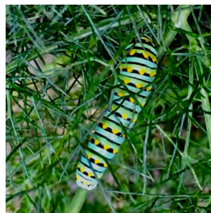
Black Swallowtail Caterpillar on Fennel Resembles Monarch Caterpillars

Occasionally, the garden gets a rare butterfly visitor, and this is such a year. Over the last few summers, a single Zebra Longwing butterfly might visit the garden in late summer. This neotropical butterfly is common in Florida but not in the Carolinas. Perhaps due to climate change, more of them are coming north; we have had three of these butterflies in the garden since early August. They use passionvines as a host plant, so I will be monitoring these plants to see if any caterpillars show up. Come join me for this and other nature experiences our butterfly garden has yet to reveal.