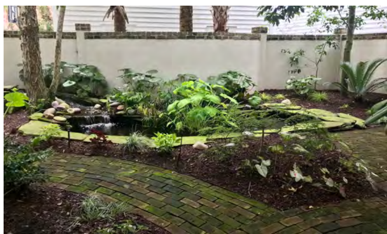
The Fowler's rear garden