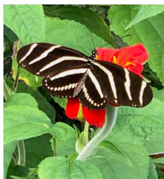
Three uncommon Zebra Longwings are visiting the garden now

April Gordon ( dr.aprilgordon@gmail.com )