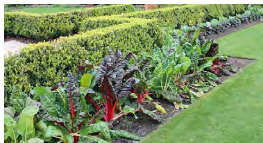
Swiss chard and kale are good choices for edible landscaping