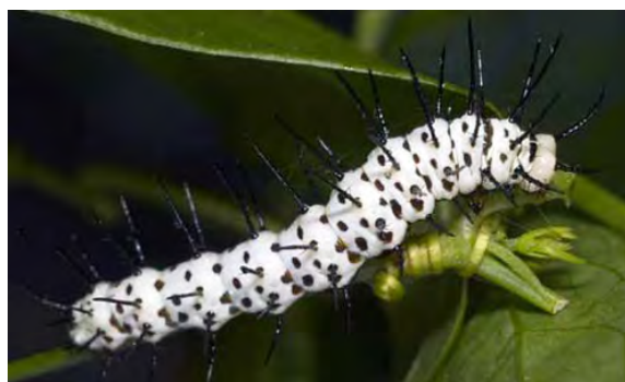
The Zebra Longwing caterpillar will be hard to miss on our passionvines