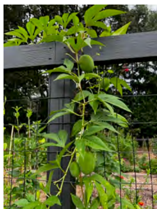
When this passion fruit ripens, it is edible and delicious

Knowing names is just a start, however, to appreciating the plants and butterflies around you. For example, as you stroll, notice that the beautiful flowers on the passionvines are now producing a green fruit. Did you know the ripe fruit is delicious to eat? Most important for us, passionvines are the main host plant for the bright orange Gulf Fritillary butterflies you will see in the garden. By summer's end, most of the passionvine leaves will be eaten by caterpillars. Another garden plant is bronze fennel. Its currently blooming yellow flower heads and feathery leaves are both edible and the mature seeds are a well-known culinary spice; all parts of fennel taste like licorice. Fennel is a host plant for the Black Swallowtail butterflies seen recently in the garden, so be sure to look for caterpillars on them. Our most important host plant is milkweed; its leaves are the only food endangered Monarch caterpillars can eat. Providing milkweed is especially important now before the Monarch migration to Mexico begins in September.