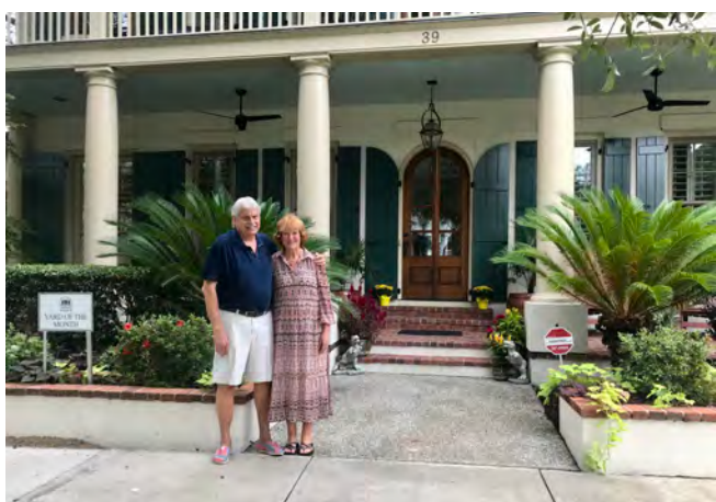
The Fowler's front garden

Our next award will be in October when we will be looking for I'On's Most Spooktacular Halloween House! Details to follow soon!