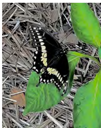
Black Swallowtail Butterflies lay eggs on bronze fennel plants