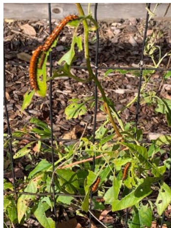
Gulf Fritillary Caterpillars