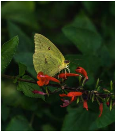
Cloudless Sulphur on Scarlet