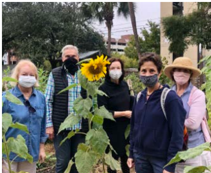
IAH tours MUSC gardens