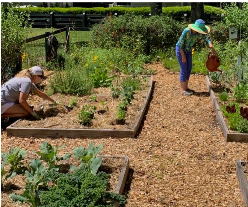
I'On Community Garden

To sign up for a plot in January, send an email to iongarden@gmail.com and request an application form.