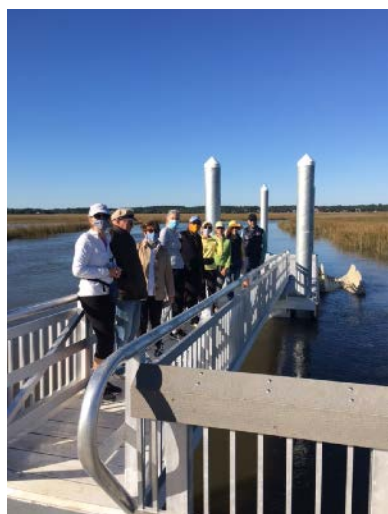
IAH Group Hike. James Island County Park