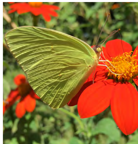
Cloudless Sulphur on Mexican Sunflower