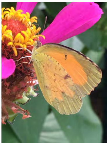
Sleepy Orange Sulphur on Zinnia