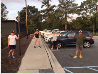
IAH hiking group at Mt. Pleasant track