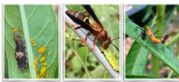
Syrphid fly larva eating aphids

Community gardeners, like other gardeners, have to contend with many challenges to raising healthy plants and reaping bountiful harvests. One is myriad insect pests that chew holes in plant leaves, eat fruit and vegetables, and produce voracious larvae that can quickly defoliate plants and even kill them. What is a gardener to do to win the battle against such formidable foe? A common response is to smother plants with toxic insecticides that kill all insects they contact (not to mention their adverse effects on humans, pets, and wildlife). An often unrecognized downside of this approach to pest control is that it ignores the fact that most insects in the garden are harmless or, better