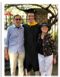
Pictured with his parents