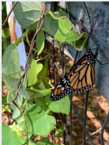
Newly emerged Monarch butterfly