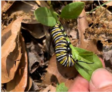
Monarch caterpillar on Milkweed