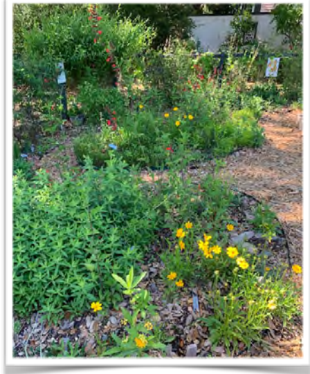
I'On's Butterfly Garden in early spring

For more information regarding the Community Garden contact April Gordon .