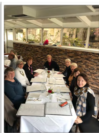
IAH Members having lunch at Blossom