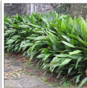
Cast Iron Plant