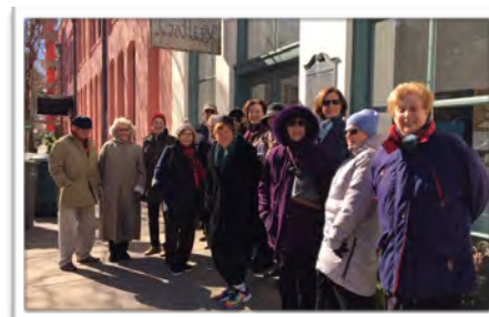
IAH Members on a Historic Walking Tour of Charleston

Spring is a time for new blossoms, freshly cut grass, and a host of fun events, but it is also a busy moving season! With this, there may be many new I'On residents not familiar with I'On At Home (IAH), an I'On "village" organization for folks over 55. IAH is run by a volunteer group with a focus on cultural, educational and social events, as well as providing helpful services to assist older residents in remaining self-sufficient in their own homes. If you're an empty nester, a single person, or simply someone looking to have like-minded, active friends to do things with, IAH may be the right organization for you to meet and make new friends!