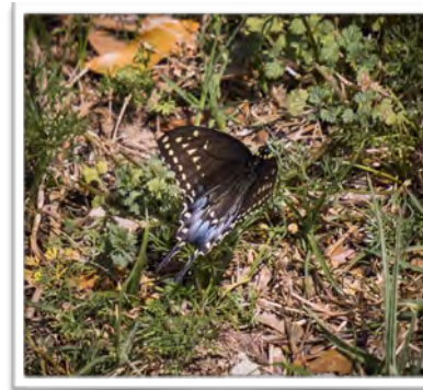
Eastern Black Swallowtail, Picture by Gilly Wallace

In mid-March, the butterfly garden volunteers (aka: Team BG) gathered for the garden's spring cleanup in anticipation of the long season ahead. Many plants are emerging from their winter dormancy and some are already blooming to welcome spring butterflies and bees!