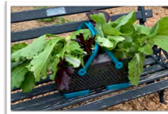
Fresh Pickings at the Community Garden

Mild weather has provided ideal growing conditions in the Community Garden where organic, fresh produce can be grown year round. Although spring crops have only been planted since February, gardeners are already picking tender young lettuces and cilantro among other fast growing crops! All of us are inspired by gardeners who grew crops over the winter and produced abundant harvests such as these mustard greens and bok choy. Now we look forward to the summer growing season which will begin in April. Visions of tomatoes dance in our heads!