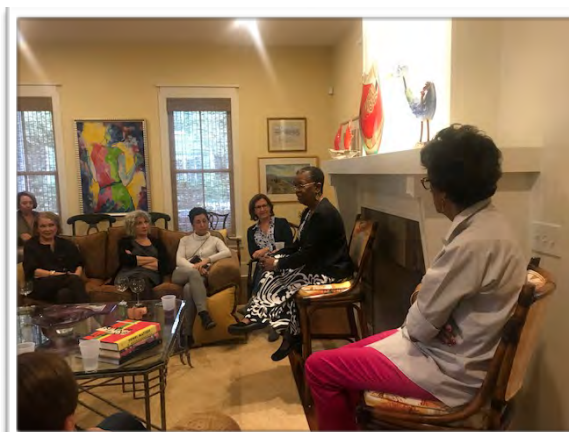
IAH Members spending the afternoon with author Beverly Jenkins