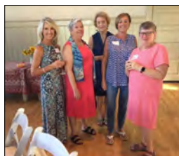
July Potluck Dinner