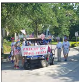
July 4th Parade