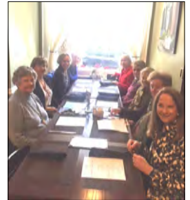
February Lunch Bunch-ers enjoyed the Nathaniel Russell house and Eli's Table