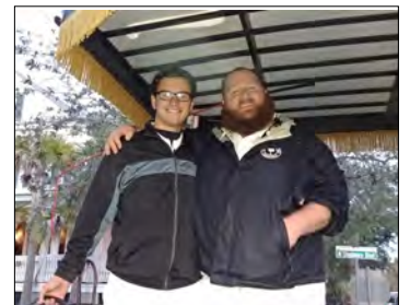
Palmetto Carriage Drivers

You are cordially invited if you have an interest in hand needlework, whether it be knitting, crocheting, needlepoint, rug hooking, even jewelry-making. We share ideas, tips, assistance, and lots of fun conversation!