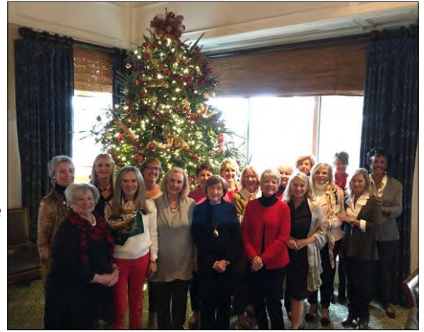
December Lunch Bunch