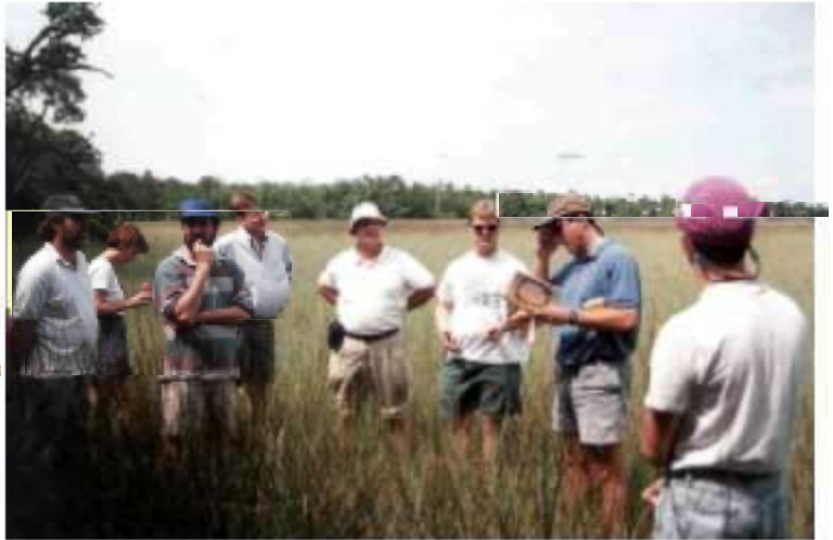
Ceremony Participants standing in the Marsh. Among the books read from was the Prince of Tides by Pat Conroy.