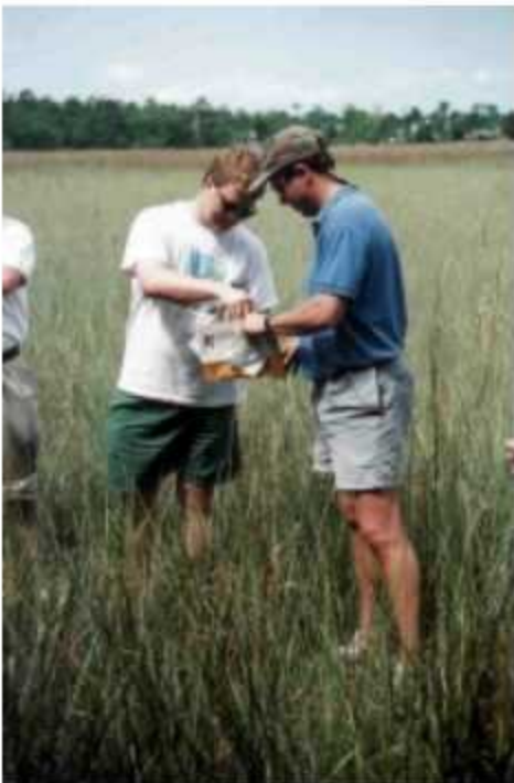
Left, Mixing the Materials, envelope and note on page one are visible.